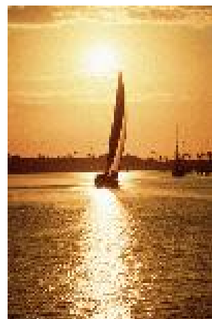
Newport Harbor at Sunset

Orange County's John Wayne Airport is just 5 miles away from the hotel, and the hotel provides complimentary transportation to and from the airport. Los Angeles International Airport (LAX) is an alternative airport located approximately 40 miles away. Discounted group shuttle service from LAX to the hotel will be available for conference participants. Please see our website for details.