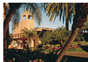
The Hyatt Regency Newporter